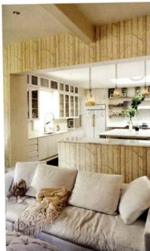
THE KITCHEN PENINSULA and doorway opening that face the family room (ABOVE) are covered in a tree-themed, neutral-hued wallpaper. A comfortable white sofa and oversize upholstered ottoman in the family room is a favorite spot for lounging guests. Contemporary Italian pendant lights (DETAIL, FACING PAGE) dangle above the peninsula. The beading and silver baubles add a dash of glamour.

particularly dazzling because it is positioned directly under the cupola. "I wanted the island totally flooded with natural light," says Alina.